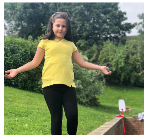
Walking the wall - great balance