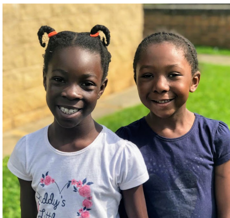
Hanging out with friends