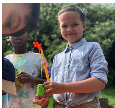
We love the bubbles