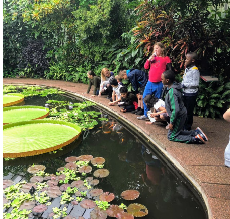
Giant lily pads, but don't try jumping on one