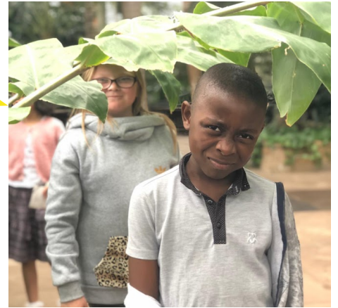
Who needs a sun hat when you can have a big leaf instead