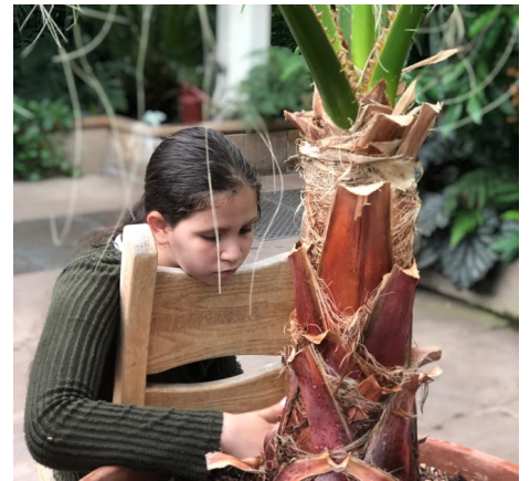
Deep in thought