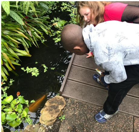
Don't fall in.....