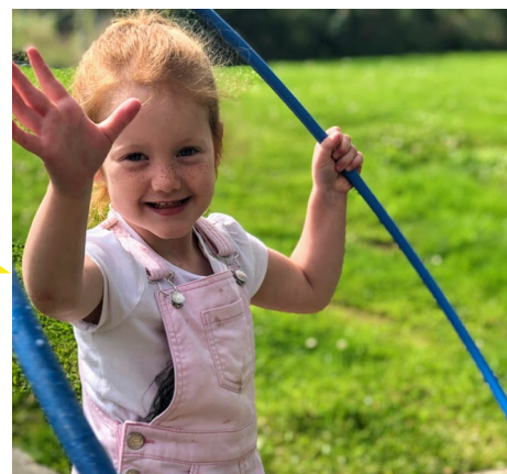
Enjoying the sunshine