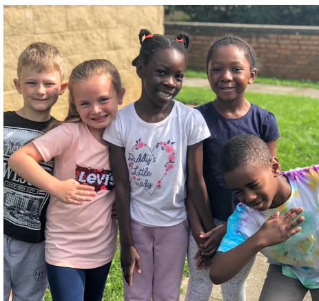
Group pic from of our PY Family

We had lots of fun back at the project too! On all of the six Friday's of the holidays we ran fun clubs where children got the chance to play outside in the sun. The sand and water pits were particularly popular along with the bubbles and staff encouraged children to play creatively.