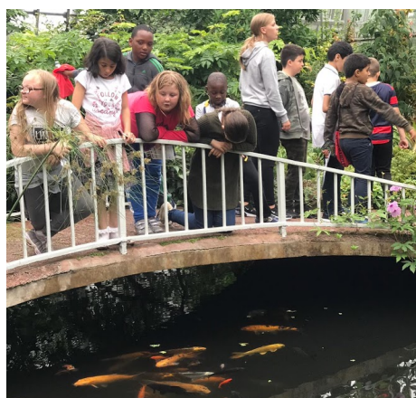
Too many fish to count