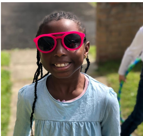
Looking cool at PY