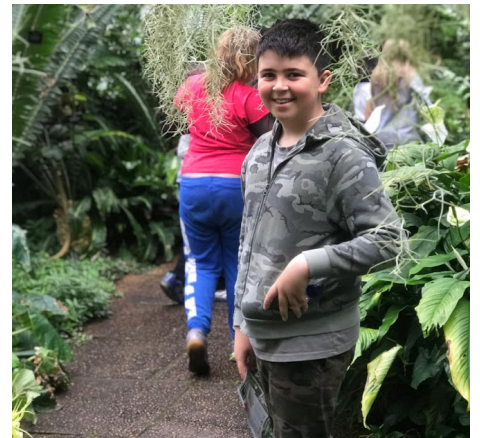
Deep in the woods