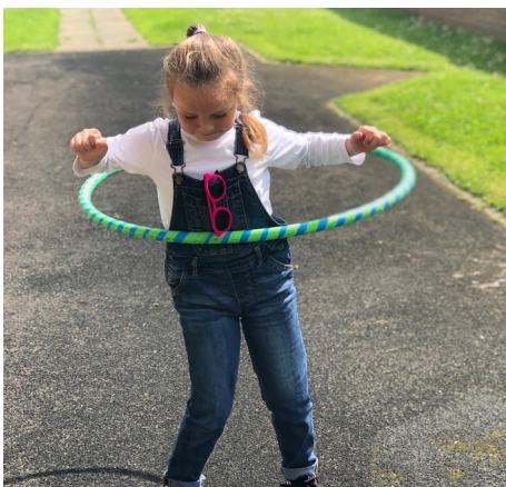
Concentrating on hula hooping