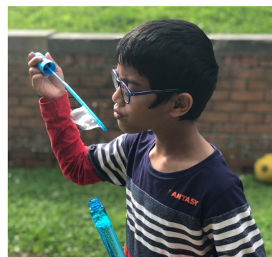
Who can make the biggest bubble!