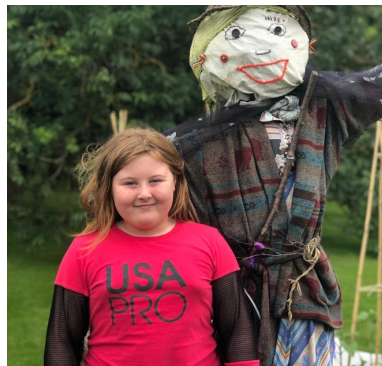
Another one for the album