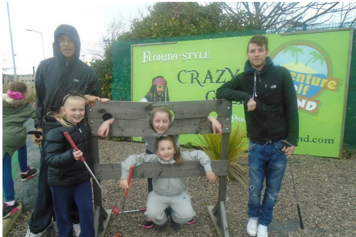
We had an at Adventure Island in Dunfermline for some crazy, crazy golf.

We had over 20 outings and activities over the 2 week holidays with nearly 200 children and young people attending. We all had a great time, thanks to Mr Weather for being kind to us!